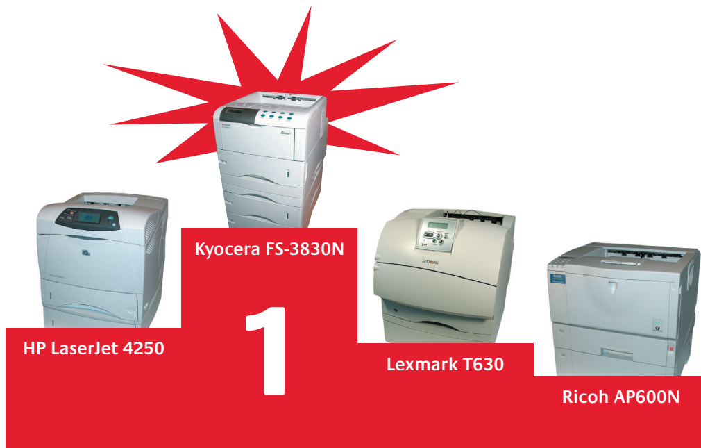
The giants in test were beaten by the smallest and most compact printer!

The experts of the test magazine Druckerchannel.de examined four 32-43 ppm laser printers for a six month period printing 1.2 million sheets of paper. Outstanding test winner was the Kyocera FS-3830N. The monochrome ECOLaser printer demonstrated high quality, easy handling and lowest total costs.